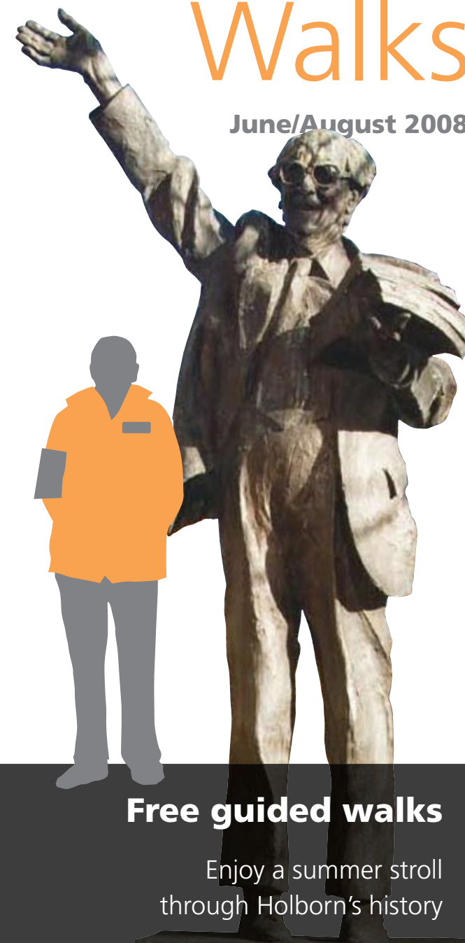
Fenner Brockway Statue by Ian Walters, Red Lion Square